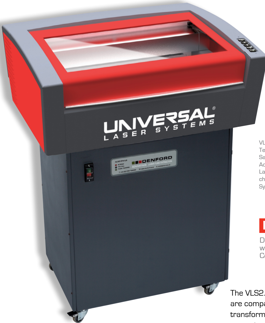
VLS Series Laser shown with Denford Advantage Extraction Unit

For LaserCAM 2D Design Software see pages 34 - 35