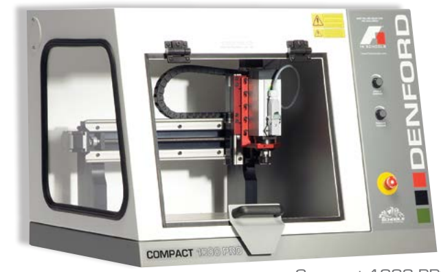
Compact 1000 PRO

8 Gram Competition Cartridges (pack of 120).